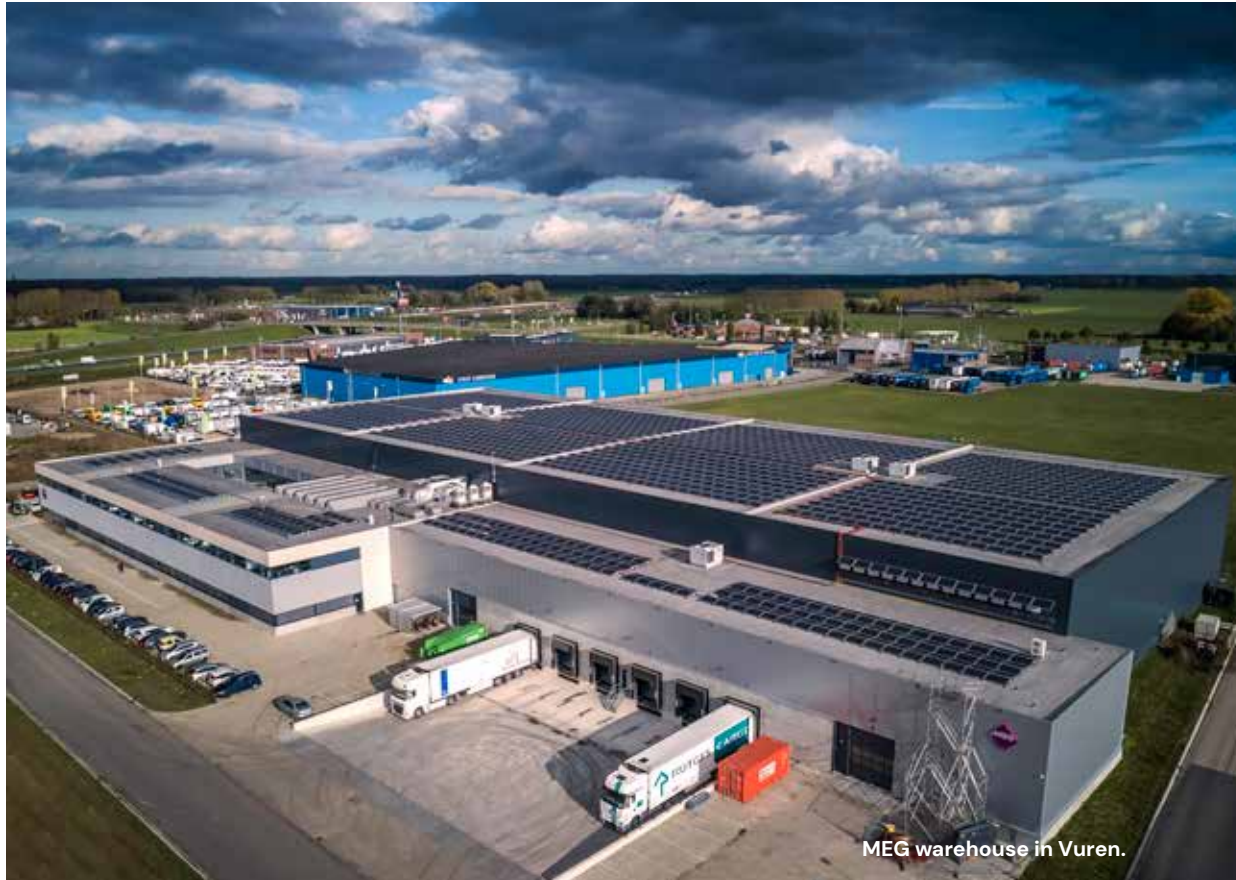
MEG warehouse in Vuren.